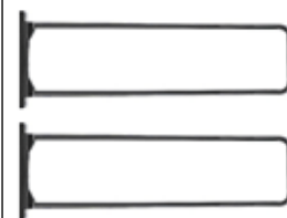
Sign Trim Bracket - 9" x 36" OSIZ3UNCTRIM36BK (2 brackets included in package)