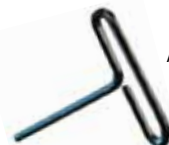
RHBSKT100 Allen Wrench Tool For Set Screws

Custom Products Corporation • 1-800-367-1492 phone • 1-800-206-3444 fax • www.cpcsigns.com