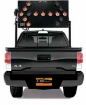
32" x 60" Arrow Board 90° Auto Mount Shown