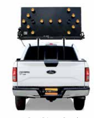
36" x 72" Arrow Board Over-the-Cab Low Profile Mount Shown