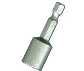
RH141HEXSETTER Driver For Screws

Fits 2 3/8" - 3" Diameter Round Posts 7.75" X 6.0" | 0.3 Lbs Net Wt.