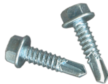
RH141HEX Self Tapping Metal Screw (2 Required)