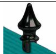
Decorative Top Finial OPOZF1317FBK (includes black set screw)