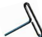
RHB5SKT100 Allen Wrench Tool For Set Screws