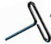
RHBSSKT100 Allen Wrench Tool For Set Screws