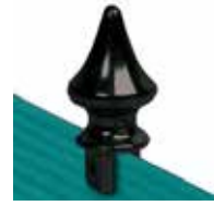
Decorative Top Finial OPOZF1317FBK (includes black set screw)