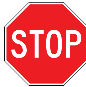
30" STOP Sign S3030R11HA HIP Sheeting