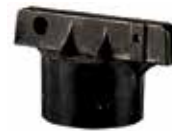
Round Post Cap OSIZ1R3P993FBK (includes black set screws)