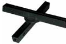
Crosspiece OSIZ1CRJ412CFBK (includes black set screws)