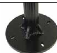
OPOR3ASMWBK Surface Mount Welded Plate