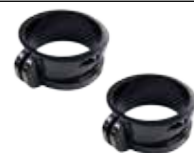
Sign Panel Brackets OSIZ5SPR3BK (2 brackets and black set screws included in package)