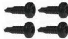
Black Torx Head Screws OZHRHBTH140 (included with sign arm brackets for mounting 2 bent lip design street name signs to sign arm brackets)