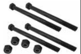
Hardware Set OZHRH03 (Set of 4 for mounting 2 sign brackets to post)