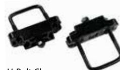
U-Bolt Clamps OTSBZS3UBCLAMPBK (Set of 2 included in each package for mounting traffic sign to post)