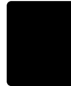
Traffic Sign Backer OT5BL2430BK Laminate Vinyl