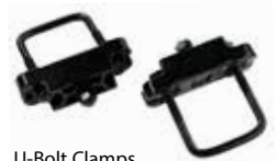
U-Bolt Clamps OTSBSZ3UBCLAMPBK (Set of 2 included in each package for mounting traffic sign to post)