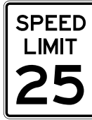
24" x 30" SPEED LIMIT Sign S2430R21(XX)HA HIP Sheeting | *Specify Legend