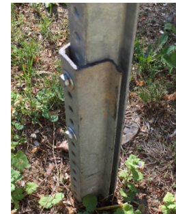
RPOCZSAFETYSPICE for 1-2 1/2 lb posts RPOCZSAFETYSPICE3 for 3-4 lb posts

A POZ-LOC® Performance Post anchor can be driven into the ground first, allowing crews to work at ground level for quicker, cost effective installations or replacement of damaged sign posts.