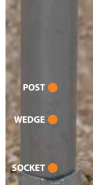
RPORZPOZLOCSW for 2 3/8" O.D. Post

POZ-LOC® Socket System - a simple, cost effective way to install small signs without digging, concrete, threading, or nuts and bolts. Simple to use, a socket assembly includes a 27" socket & wedge.