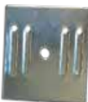
BA080SAVER .080" Aluminum 3" X 3" Ribbed Square

Also allows mounting to chain link fencing.