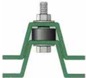
RPOCZSAFETYSPLICE for 1-2 1/2 lb posts RPOCZSAFETYSPLICE3 for 3-4 lb posts